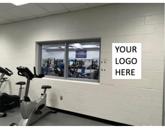
On Wall Next to Weight Room Door