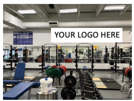
Above Mirrors on Back Wall