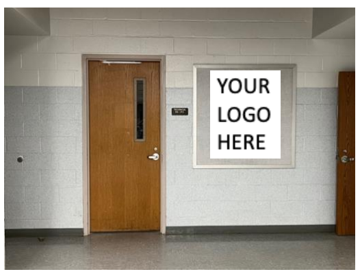
Next to Tech. Ed. IPC & Doors to Classrooms