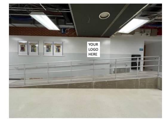
Ramp to Tech. Ed./Hallway Side