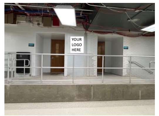
Top of Ramp to Tech. Ed./Hallway Side