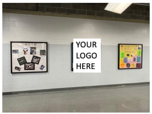
Hallway leading to Tech. Ed./Cafeteria Side

$750/year for a 3-year commitment & one-time cost of signage